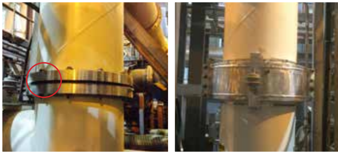
Above left: A leaking flange at Southern California Edison's Valley GIS. Above right: the installed custom enclosure from Colt.